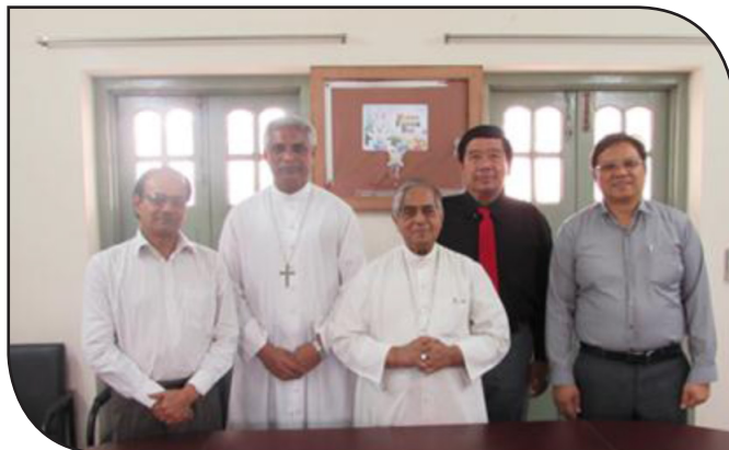
Catholic Bishops' Conference of Bangladesh and the United Forum of Churches in Bangladesh (CBCB-UFCB)