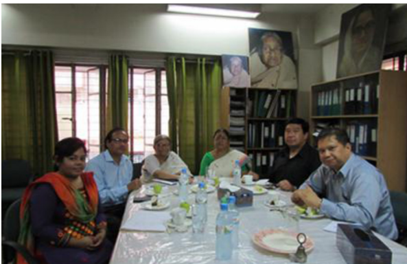
Bangladesh Women's Council