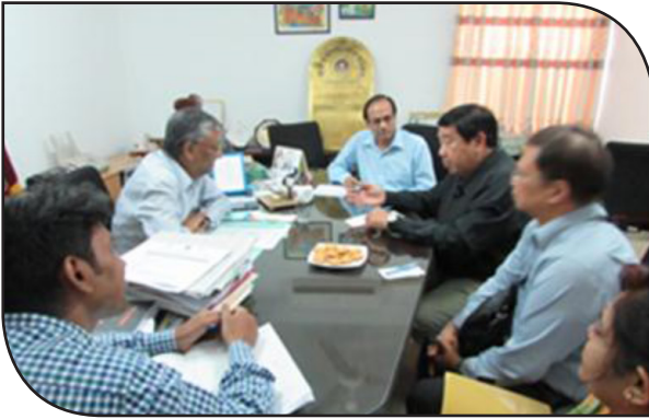
National Human Rights Commission