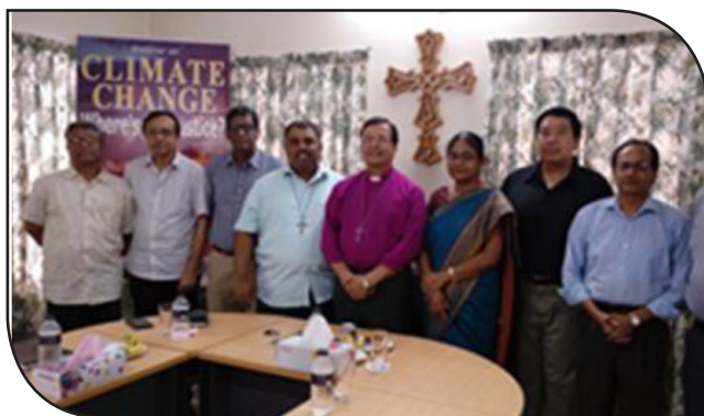
Church of Bangladesh (CoB)