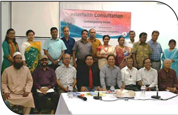
Discussion with interreligious leaders