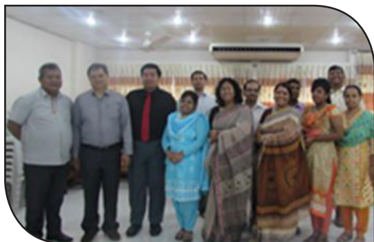
YWCA & YMCA