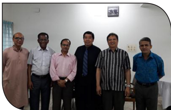
Bangladesh Baptist Church Sangha (BBCS)