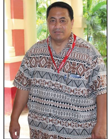
Participants of AMC at the Myanmar Baptist Convention.