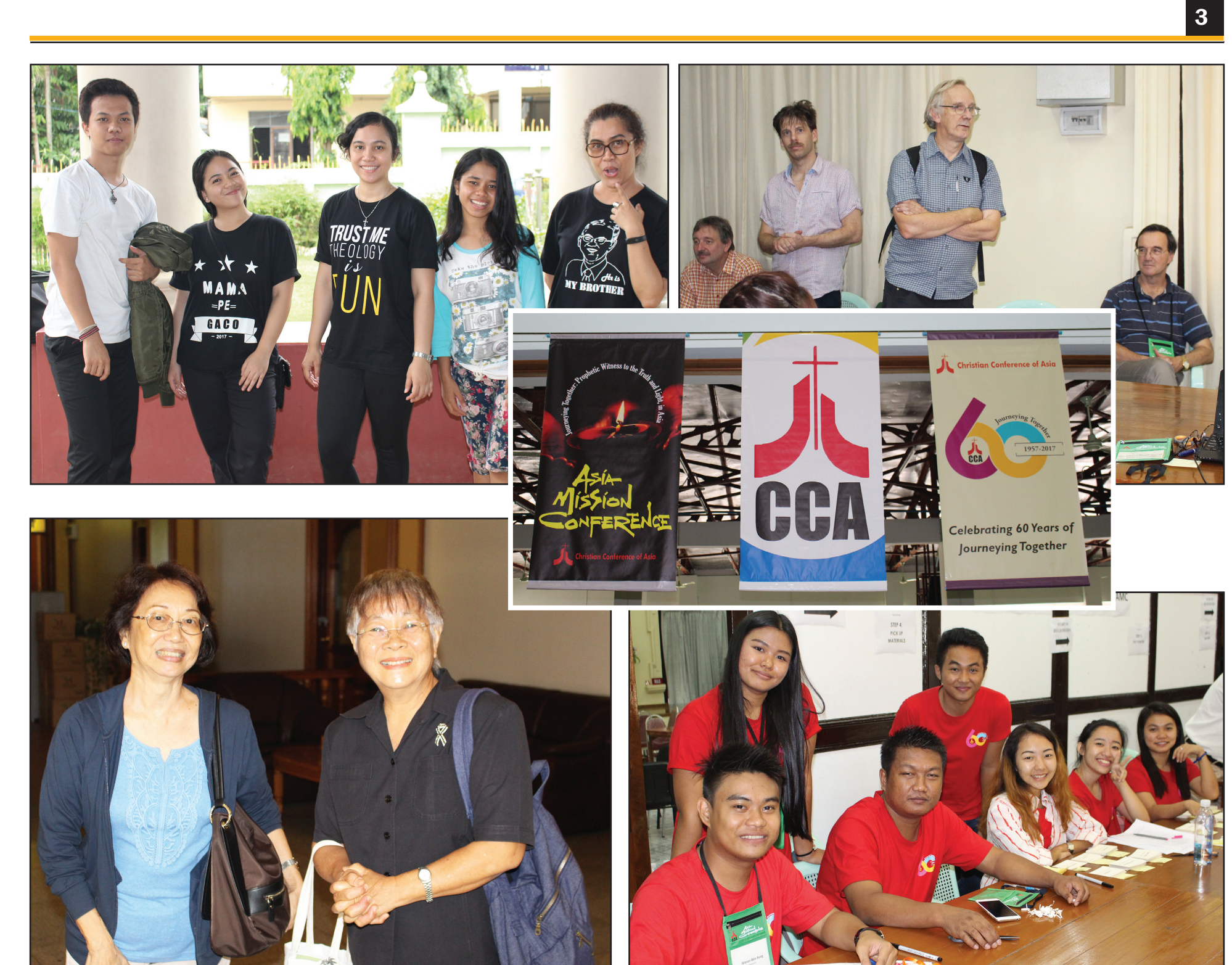
Clockwise from top... Youth have fun at the event. Delegates seen at the registration desk for the AMC and CCA events. Above, volunteers pose for posterity.