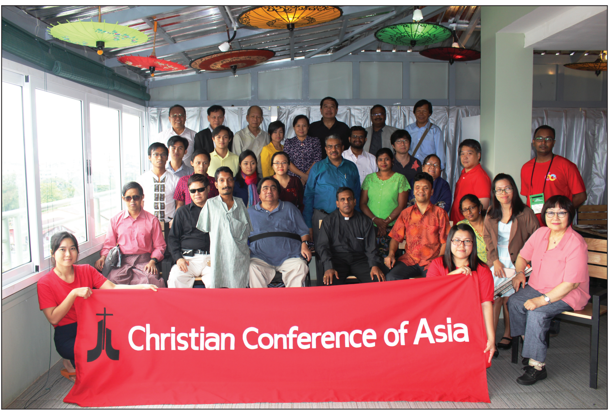
Participants at the Asian Ecumenical Disability Advocacy Network (AEDAN) programme held Wednesday at Hotel 99, Yangon, Myanmar.