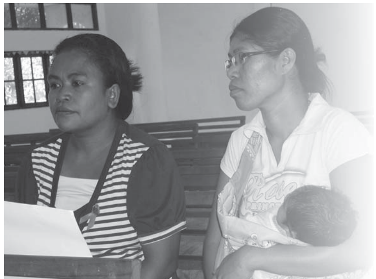
Some of the women participants at the HIV and AIDS Awareness Seminar in Timor Leste in August 2009, conducted by CCA