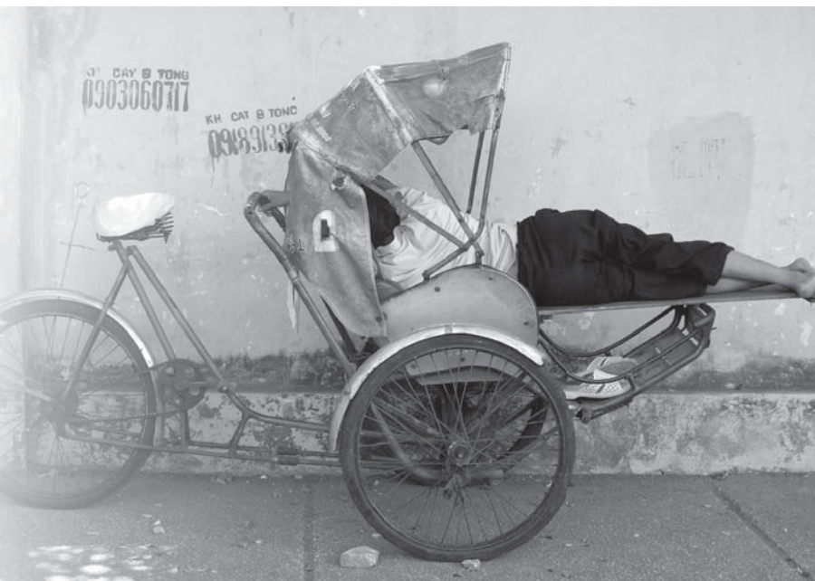
A worker in Vietnam taking a rest from a tiring day.