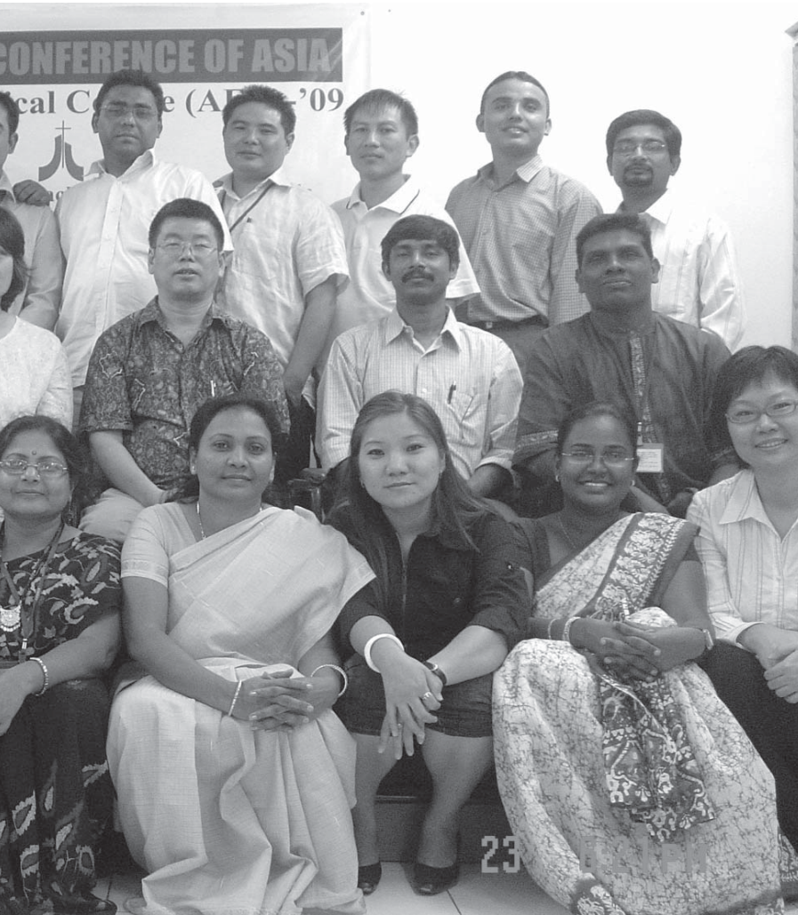
The 2009 AEC participants

perspectives. Many resource persons referred to the root word of oikoumene, i.e. oikos, which is commonly shared by economics, ecumenism and ecology. Hence, the wider ecumenism has to do with life in all its socio-economic-political dimensions, not only of humanity regardless of faith or ideology, but of all creation.