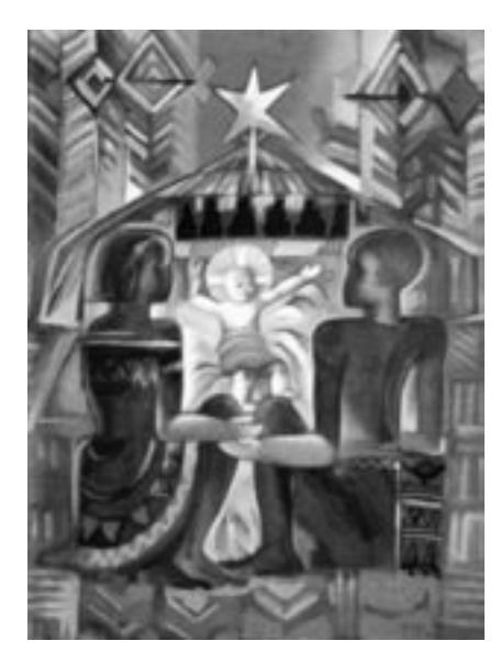
Cover: 'Nativity', by Le Van Dai, originally from Vietnam. (From 'The Bible through Asian Eyes', courtesy Asian Christian Art Association.)

The ecumenical movement has a prophetic role to play in our lives. It has always been in the forefront showing the signs of times when the majority of people live with a deep sense of hopelessness and helplessness. In this age of war on terrorism and negative effects of globalisation, it has become all the more important for the ecumenical movement to reclaim its prophetic heritage.