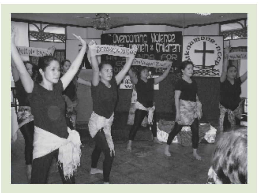
BATIS women exploring forms of violence against women