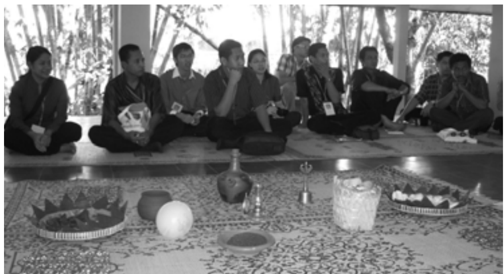
Some participants at the opening worship of the Basic Ecumenical Course in Yogyakarta.

CCA has more than 30 member churches in Indonesia and many of them have not been able to send participants to CCA programs. Thus, the holding of the BEC was aimed at reaching out to more member churches and also to initiate an ecumenical formation program which was hoped to become a CCI regular program in the future.