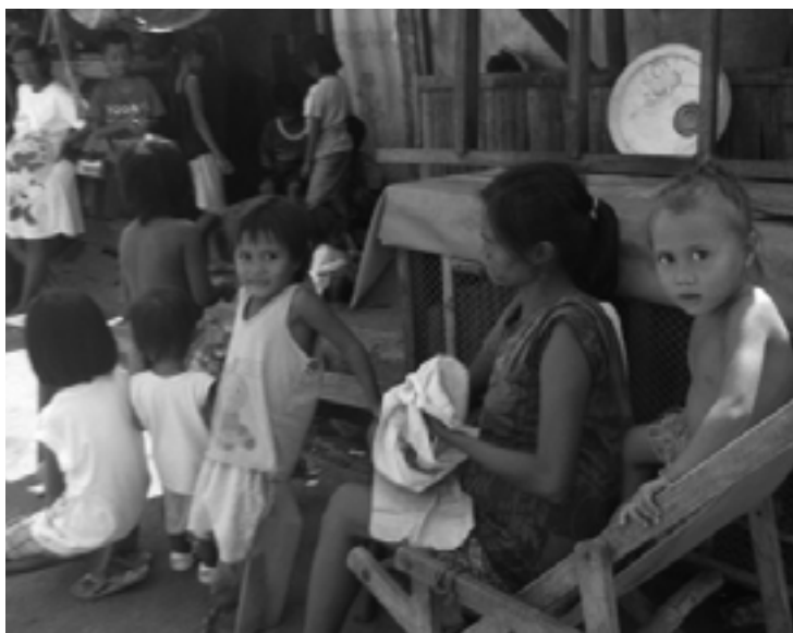
An urban poor community in Navotas, Metro Manila, Philippines.