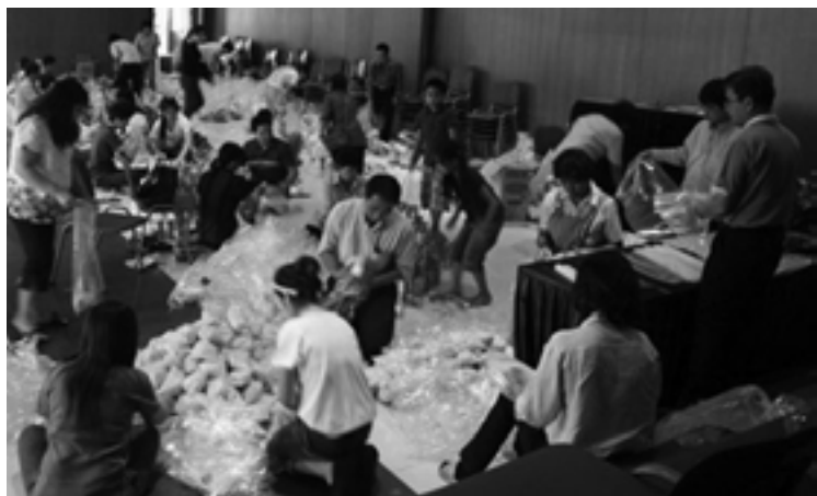
Packing food stuff for flood victims.