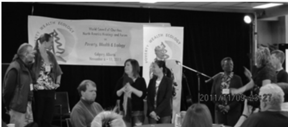
Participants role playing PWE in North America.