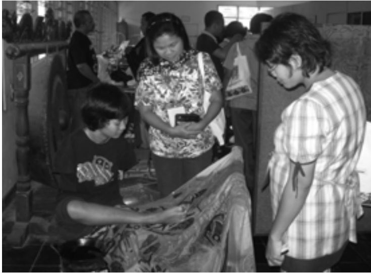
Participants visit a church-related organization for the empowerment of people with disability in Yogyakarta.

Although the BEC is a national program, CCA tried to give it an international flavor by inviting participants from the neighboring countries who speak and understand Bahasa Indonesia.