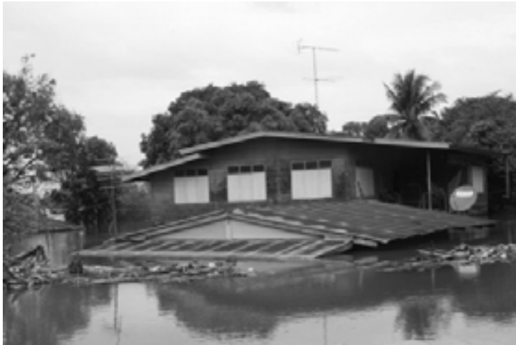
A house under water.

T hailand faced the worst flood in the last 50 years similar to the one that inundated Bangkok in 1942, where most areas were submerged in water and people moved around in boats.