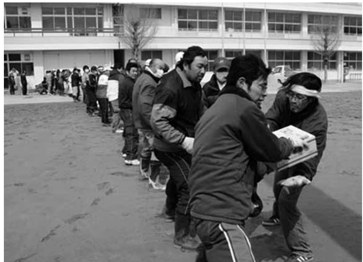
Earthquake survivors in Minamisanriku, Japan, receive food supplies.

In concrete terms, RHSB has started to collect information about people who can possibly offer housing and to introduce them to internally displaced persons through our national network of churches and organizations ( http://ncc-support.blogspot.com/ ). It is my hope that we can help relieve the pain through this relief work. However, I still ask myself these questions again and again, even after the relief work of RHSB has started: