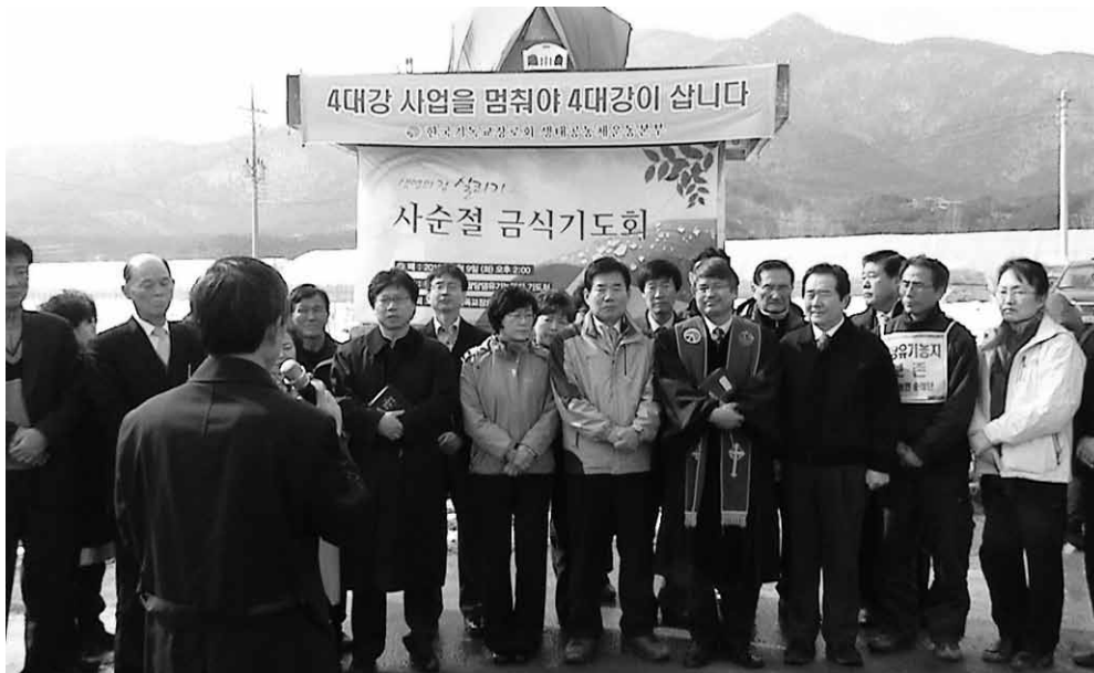
Worship during 2010 fasting and prayer campaign on the banks of Bukhan River.