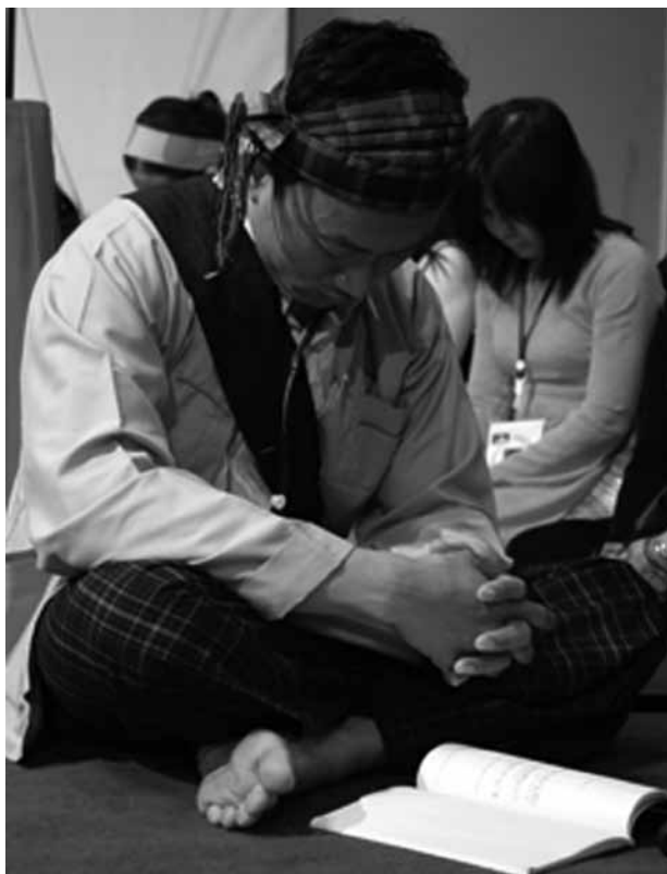
At other times, God wishes us to listen to God's call and empower others to do God's will.

How will justice and change come? It is clear in the Bible that God sent servants to speak for justice and bring forth change. In I Kings 18-19, the Bible recorded how prophet Elijah fought against King Ahab of Israel and the prophets of Baal and brought change to Israel.