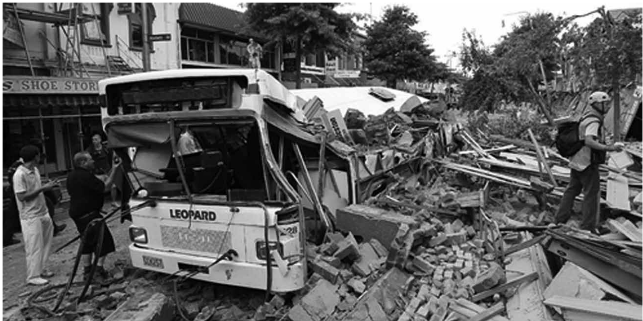
Bus in ruins in Christchurch.