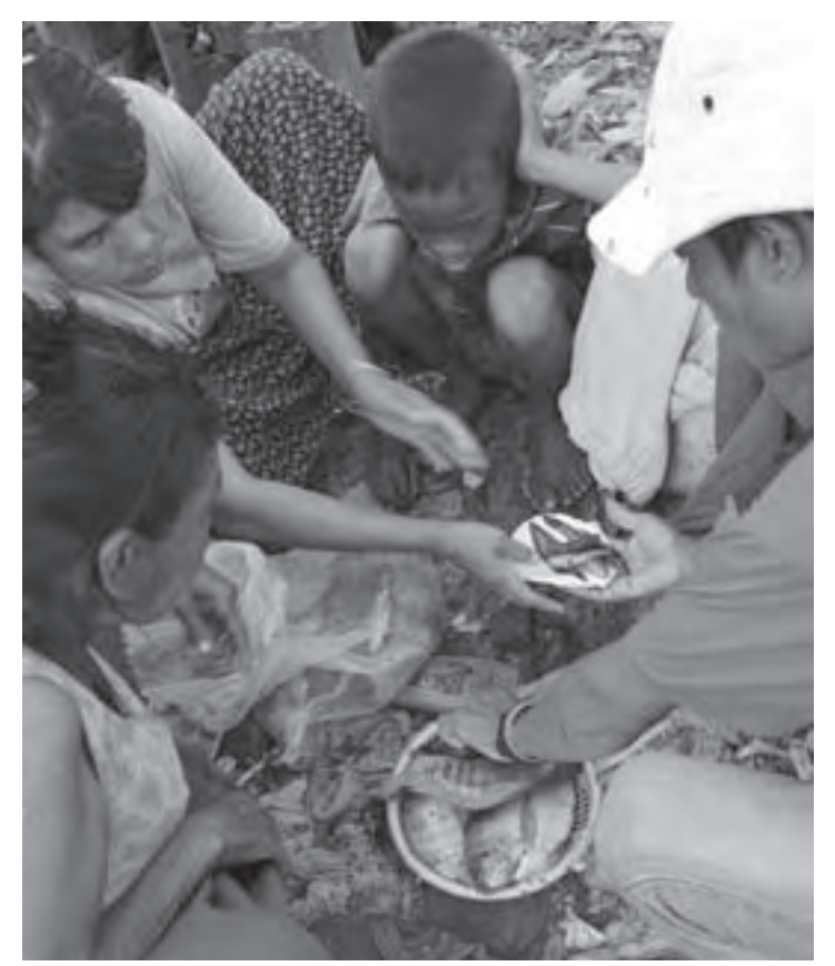
Table fellowship at the dumps. Burmese people living in the garbage dumps in Mae Sod, Thailand, sharing food.

These are carried out by humans to satisfy their greed for profit and desire to accumulate more and more. This is the ugly side of human nature and one can say this is the outcome when human beings become slaves to forces of Mammon. Jesus warned us about it when he said "One cannot serve God