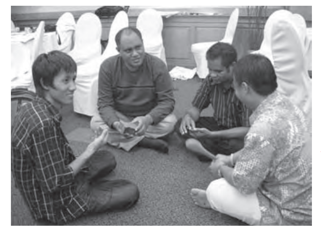
A small group discussion on masculinities during the Ecumenical School for Gender Justice for church leaders of the Mekong region

In 2011 CCA will organize the Asia School of Ecumenical Formation for Gender Justice for South Asian men and women church leaders. The major focus of this training will be ecumenical formation for church leaders for promoting gender justice and children's rights, and on the need for advocacy to promote and implement a child protection policy in churches and ecumenical organizations.