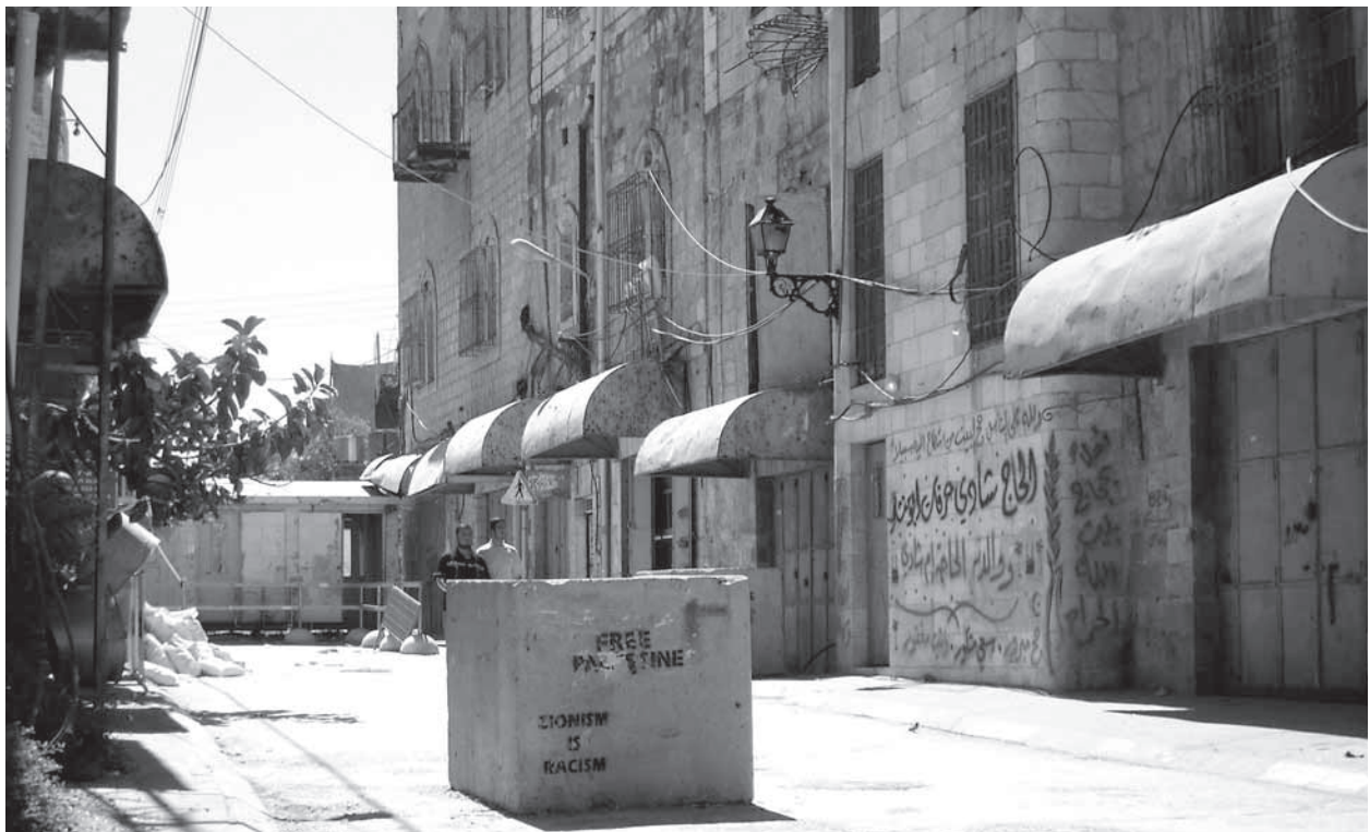
An Israeli checkpoint at Hebron in the West Bank

This action by the WCC Central Committee sums up the deliberations and actions of the Collaborative Advocacy Meeting of the Palestine Israel Ecumenical Forum (PIEF) which met in Beit Jala near Bethlehem last June 11-15, 2009. The Meeting was attended by advocacy officers from churches, regional ecumenical organizations, church agencies and specialized ministries.