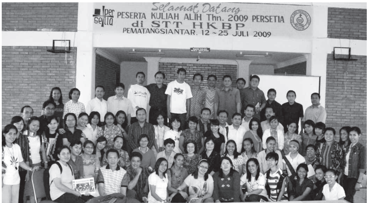
Participants and resource persons

“Does having a wider ecumenical vision mean that we have to lower or reduce the uniqueness of Christ?” One student asked following the input on wider ecumenical vision. The wider ecumenical vision encompasses intrafaith and interfaith relations and dialogue, collaboration with civil society working for peace and justice, and sustaining the integrity of the whole creation. Such a wider vision indeed requires deconstructing what uniqueness means. For Jesus, uniqueness did not mean putting himself on a pedestal for everyone to see that he is the best, if not the only way; or waving a flag to show that our religion is the best. Rather, he “made himself nothing, taking the very nature of a servant” and “humbled himself and became obedient to death - even death on a cross!” (Philippians 2:6-8)