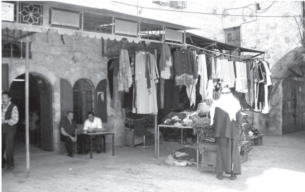
Palestinian small traders selling their wares in Hebron

Three days of reflection and animated discussion in small group and plenary settings resulted in a broad commitment to the ideal and practice of collaborative action. In sum, the participants in the PIEF gathering made the following commitments: