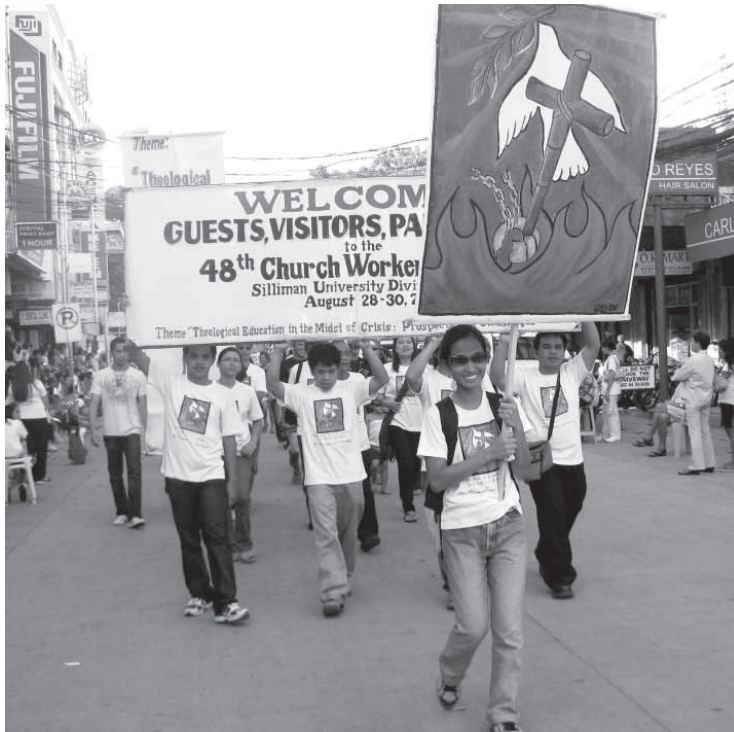
Divinity School students at the Silliman University Founders Day Parade a day before the Church Workers Convocation