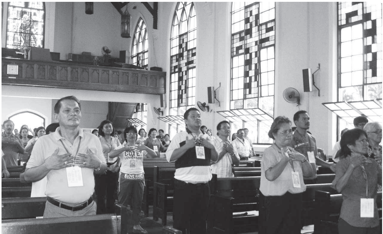
Church workers do meditative exercise before the Bible study