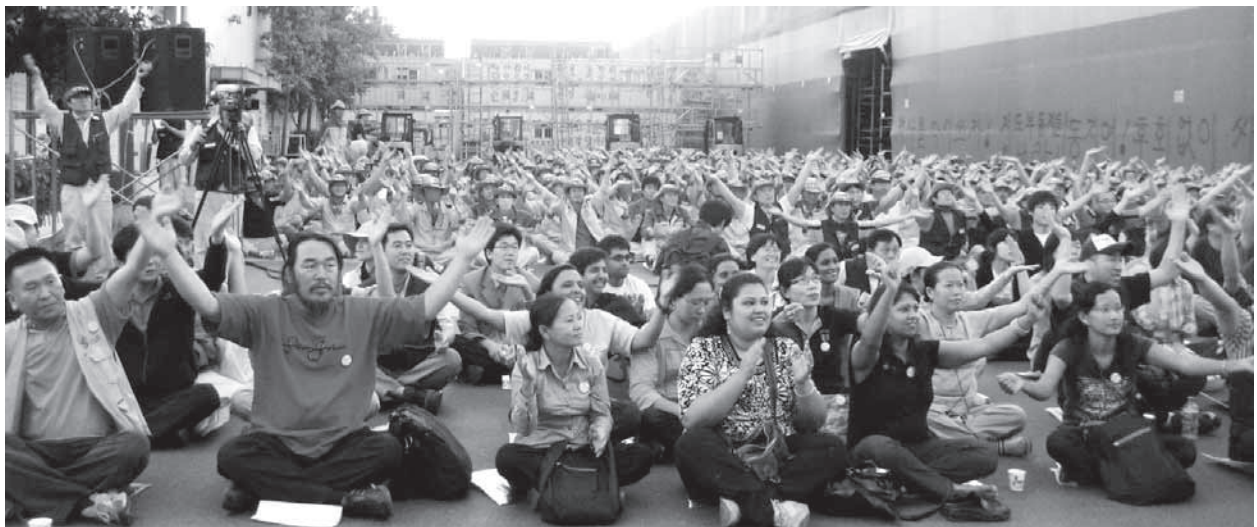
Participants in solidarity with striking workers in Seoul, Korea