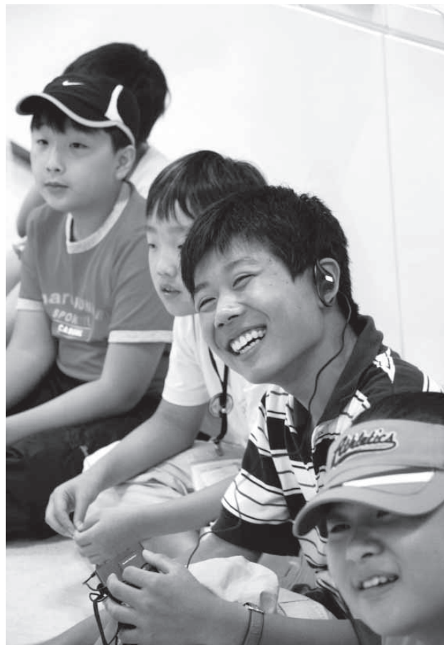
Participants at the 2008 Children's Peace Camp