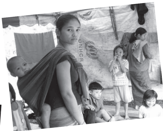
Children at the camps. Is there really a future for them?