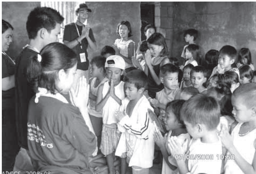
APCCS students with local children in a learning center during the social service week in Montalban, Rizal.

The other side of God's mission is always expressed through people's mission to missionaries and churches. The Good News is initially heralded not from missionaries and churches but from the poor, the have-nots, the marginalized as God's people. This is precisely the reason why we confess that God comes to the people before missionaries and churches come to them. Missionaries and churches should first and always learn what God has been doing among God's people, while they are participating in a global-local mission today. In this case, a participatory process should be the way of