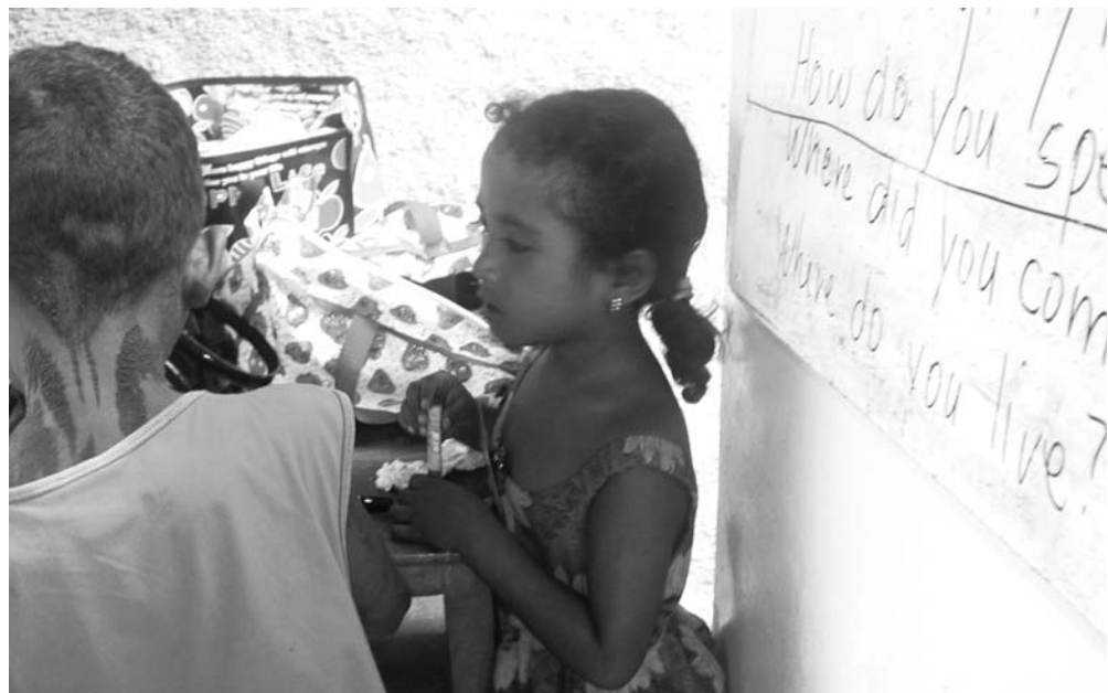
An East Timorese girl in English class

My aunt, sister of my adoptive father, with whom I was staying reprimanded me one day for coming home late. One night, she was so angry and said many derogatory things about me. 'You are a Timorese and nothing can be done about you... You are a wayward girl!'