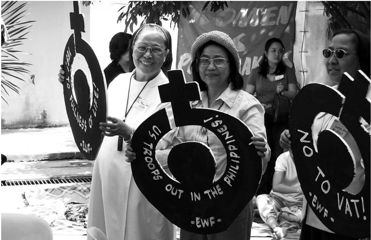
Feminist leadership is for collective exercise of power. Filipino women during an International Women's Day in Manila.

Is the exercise of power for domination of some and the exploitation, oppression, and subjugation of the other? Or is it for the nurturance of the young, for the sustenance of the dependent, and for the empowerment of those who are vulnerable so that they will soon claim their subjecthood as moral agents and power actors themselves?