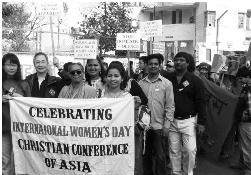
March 8 IWD rally in Kathmandu, Nepal

Whenever Christian youth and women hear of the word 'ecumenical movement' nowadays, the image of ecumenical bodies or organizations (e.g. CCA, WCC and NCCs) comes to mind. These ecumenical bodies and organizations are supposed to facilitate and promote local, regional and global ecumenical movements. But very often, Christians forget that it is the people who are the rudders of the ecumenical movement and the agents of transformation.