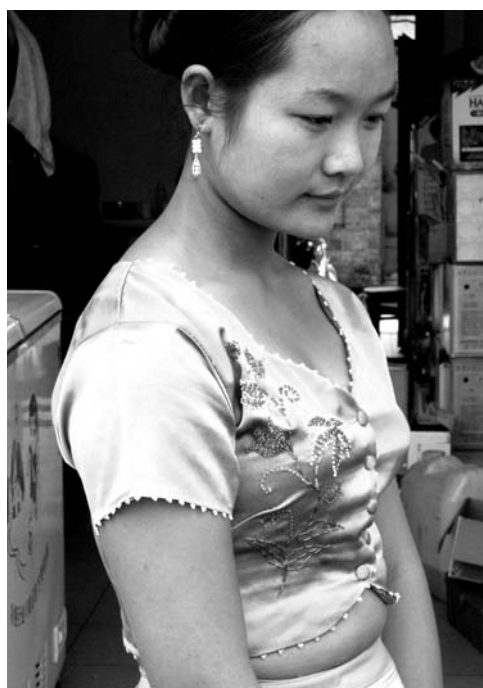
A young Tai Lue woman

A group of women from Xishuang Banna once visited Church of Christ in Thailand's (CCT) AIDS Ministry (CAM) to learn about CAM's work on HIV and AIDS. Challenged by these Chinese women, the Mekong Ecumenical Partnership Program (MEPP) responded by initiating a Personnel Exchange Program between churches in Xishuang Banna and Thailand. The program aimed to provide participants the opportunities for mutual learning and experience sharing, and to enhance personal and team development skills on HIV and