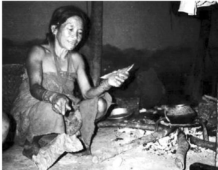
Healing takes time and attention. A Filipino woman tending the hearth.

I stayed with my 'mother' for two years. I knew she was not my real mother but I did not want to break her heart. She lost a daughter once then she found me. When my parents knew that I was in Timor Leste, they continued to support me. I studied in a university and was granted scholarship to study Theology in Manado for three years.