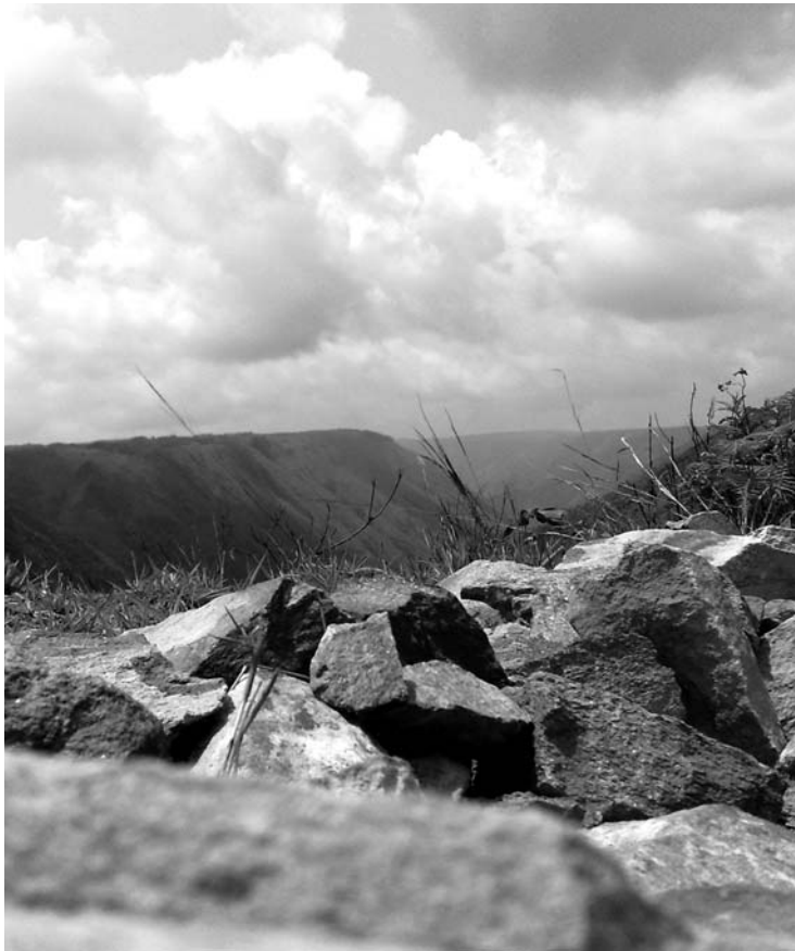
We are accountable for the survival of creation