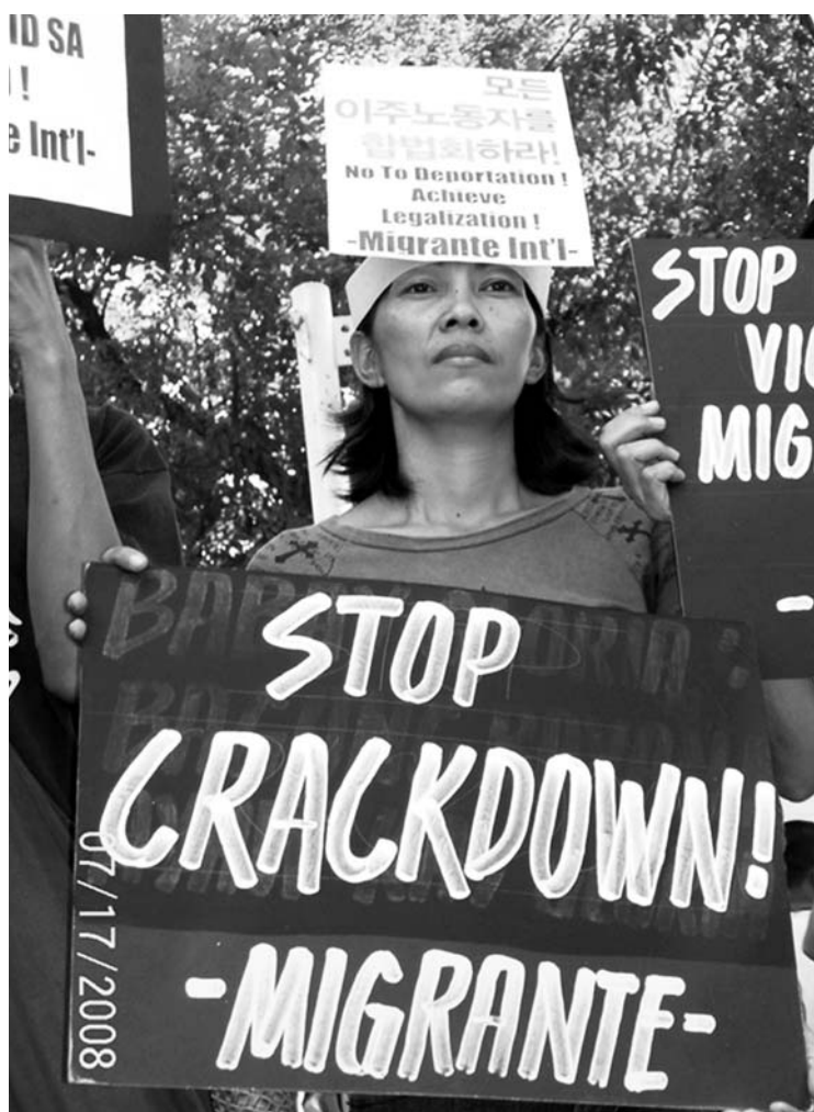
Filipino workers' protest in Seoul

to meet the basic needs of people. Reflections on labor migration begin from the experience of those who suffer the consequences of economic structures that exclude many. When the economic news is dire, when the advance of globalization has turned a “Made in USA” economic recession into a global one, Filipino migrants request Luke’s Mary to repeat her singing of the Magnificat.