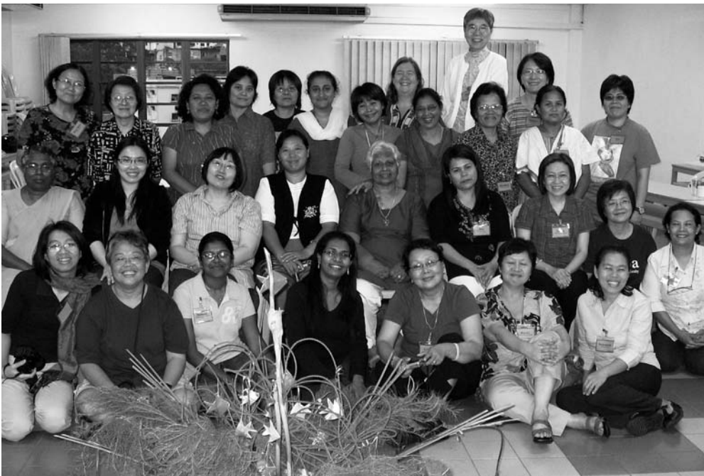
Feminist leadership workshop participants

Asian feminist women theologians in the workshop affirmed that even though majority of the women in Asia may experience oppression and marginalization, they do exercise different types of power at different times and situations. These include the power against (which shows in resistance), power to do something (including overcoming a terrible situation), power over another (which is usually for domination), power with others (which is usually shared power), and power within (which is a result of one's sense of empowerment). What is important is to know what power one has and how one exercises it.