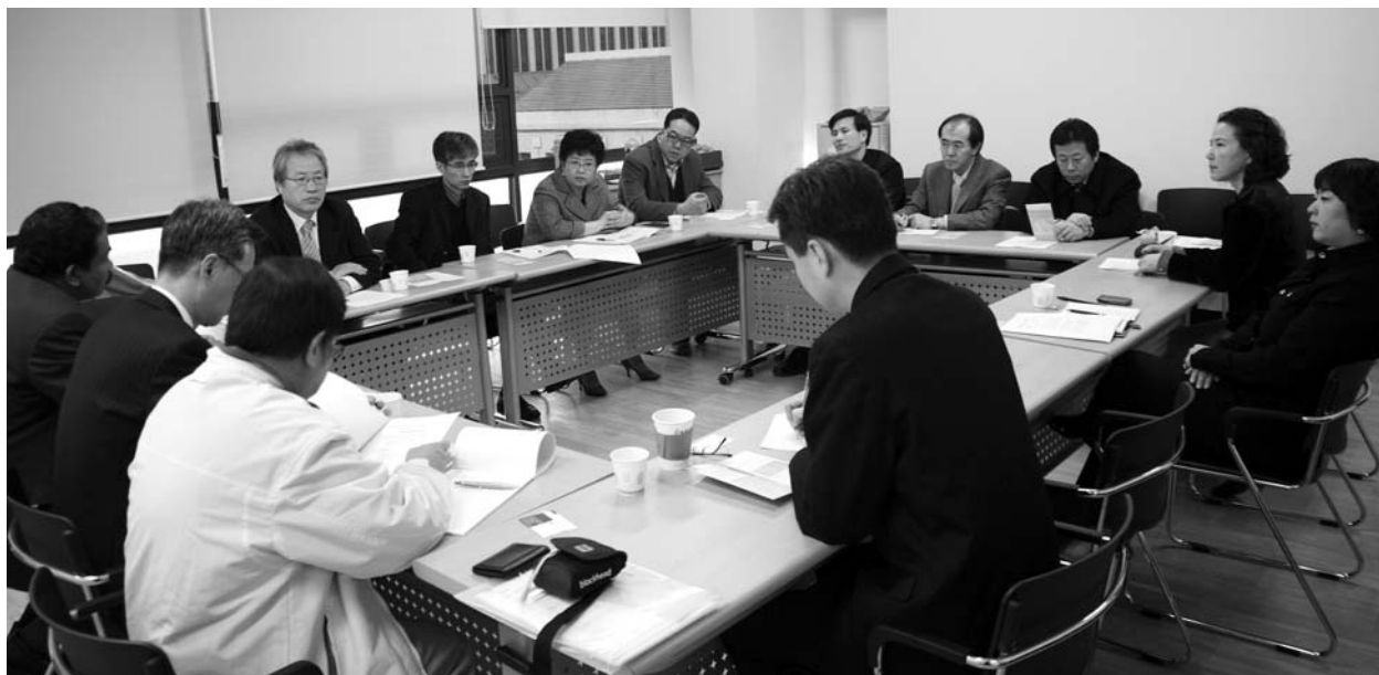
Church leaders and representatives of the Reunification Committees of Korean churches at the meeting.

Twenty five years later in October 2009, the unfinished task of Korean unification will be commemorated in prayers, theological reflections and discussions on the way forward will be held in Hong Kong on the theme, "A Continuing Journey of Peace and Reconciliation in North East Asia". A new generation of Korean young people will meet with their ecumenical leaders who were at Tozanso to carry on the journey of peace and reconciliation into the twenty-first century. Unification Committees of NCKK member churches and their counterparts in the Korean Christian Federation will lead the deliberations, the planning of future programs, and the celebrations of the twenty five years of dialogue, humanitarian response and ecumenical solidarity.