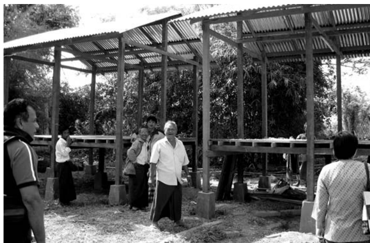
A housing rehabilitation project in Myanmar