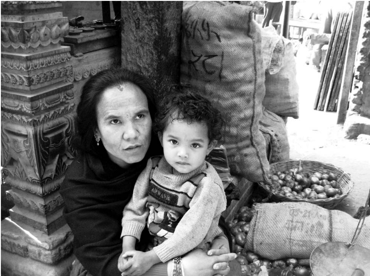
Nepali mother and child

in the communities showed that domestic violence was a frequent phenomenon during pregnancy. Dalit (lower caste community) women are extremely vulnerable to sexual exploitation in Nepal. They are not only subject to discrimination by the high caste in Nepali society but also victims of violence within their own community. Human trafficking of women and children is also increasing.