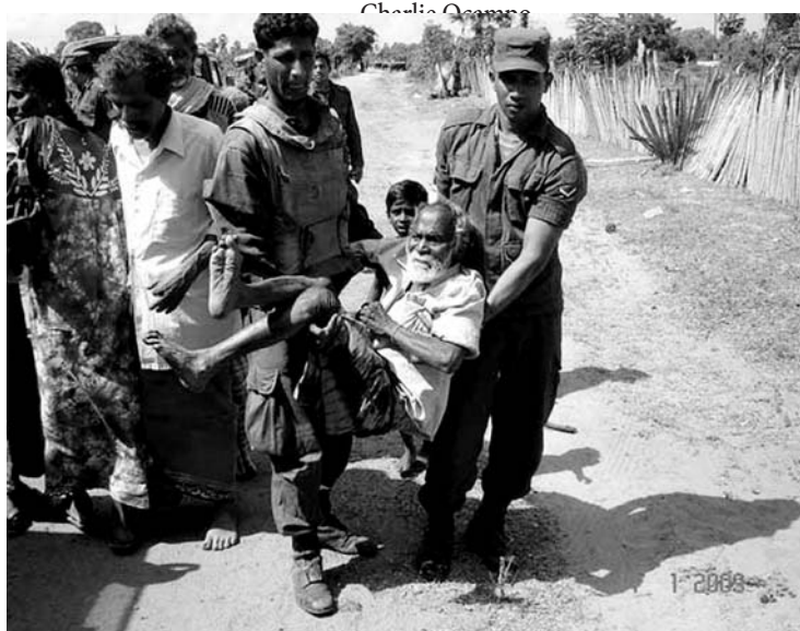
wounded civilian evacuated for treatment

CCA calls on the churches in Asia to continue praying for peace in Sri Lanka and in offering emergency assistance to the victims of the current conflict. Asia Sunday will be marked by biblical reflections and worship services on Sunday, 24th of May. This year's focus is on Sri Lanka entitled, "Tear Drop", symbolizing the pain and suffering of widows, orphans, and the internally-displaced population.