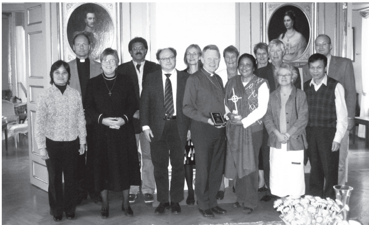
CCA delegation with Archbishop Anders Wejryd (Fourth from left-front row) of the Church of Sweden and other leaders

The church may not be as professional as some NGOs but it can learn to be more professional without giving up its nature of being church