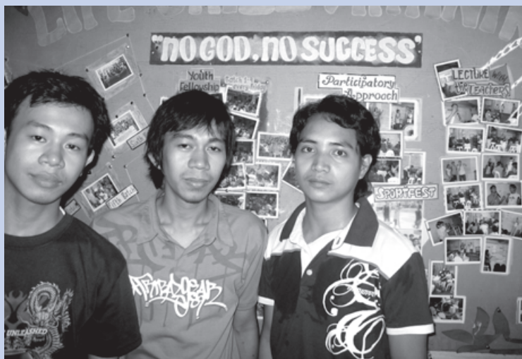
Pasay youth at the Training of Trainers Program