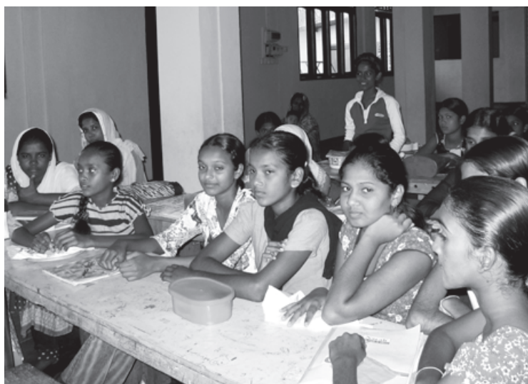
Young girls learn hand embroidery at Mattakuliya community, Colombo

Vulnerable disadvantaged youth need an integrated program to strengthen life skills and to say no to risky behaviour. Life-skills-based HIV prevention education must continually be emphasized when working with vulnerable young people. However, life skills alone are not enough. Efforts must be made