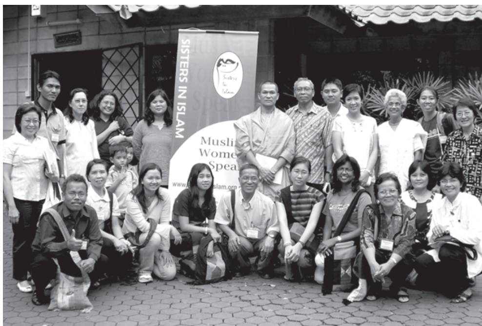
Participants in a visit with Sisters in Islam

The existence of other religions and cultures reminds us of our own uniqueness and shortcomings