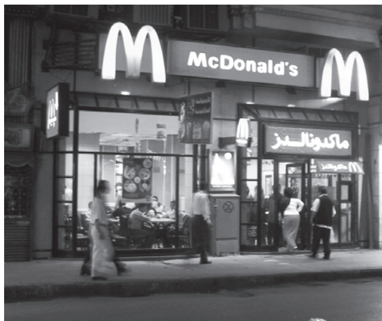
One of the symbols of globalisation

The writer of the book of Job wants to break away from this dominant theological tradition. Why does the biblical writer bring in the Leviathan motif? Is it just a poetic way of depicting God as victorious king and judge or does it symbolize the coming of the reign of God in a battle against the power of evil