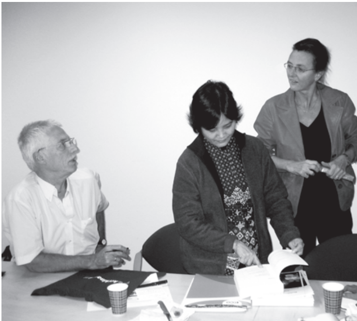
Exchanging gifts after a fruitful meeting with the Kerkinactie staff of the Protestant Church in the Netherlands