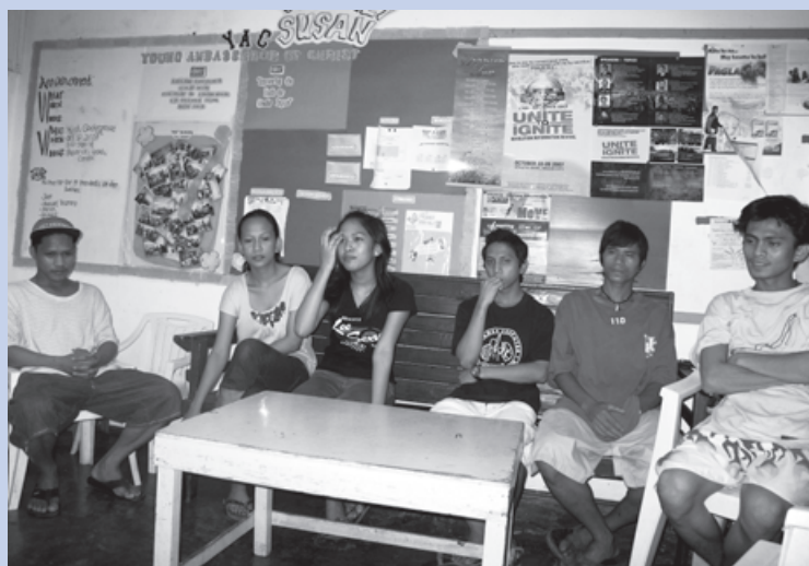
Youth share lessons learnt at the life skills training

The most important lesson I learnt from the training is how to take care of ourselves.