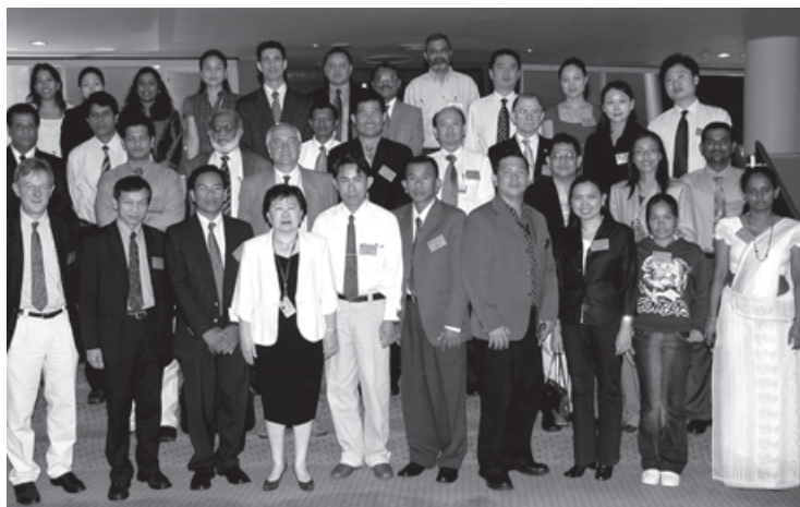
Participants at the Mid Term Review of CCA-UNESCAP project "Strengthening Life Skills for Positive Youth Health Behavior" held on 5-6 November, Bangkok

In response to their request, Sarvodaya has initiated a hand embroidery course to train young women. Approximately 15 have currently enrolled into their program. Classes are conducted on a weekly basis at the Sri Wickramasinharamaya Temple premises in the Mattakuliya area. Sarvodaya has provided initial assistance for materials like sewing frames, fabric and thread.