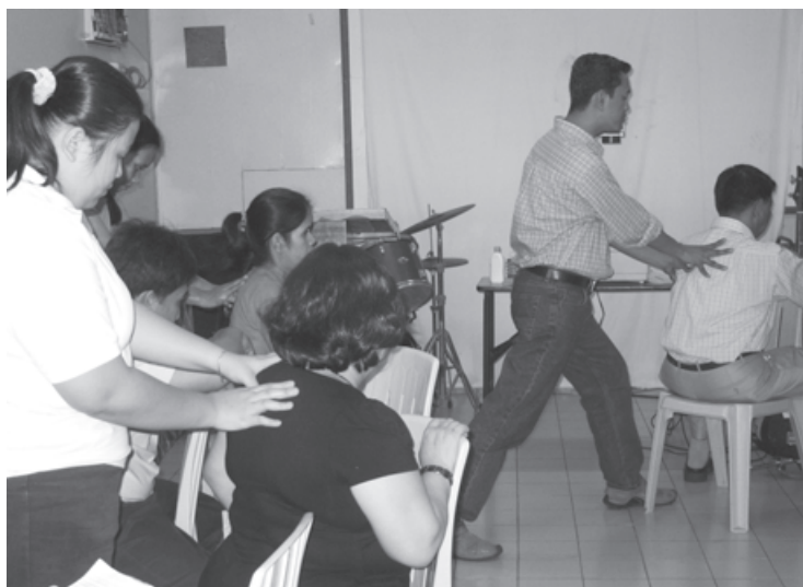
Massage Therapy training by TESDA, Pasay City

The training courses currently initiated for out-of-school youth are barista - coffee making course, reflexology/massage therapy training, housekeeping and others.