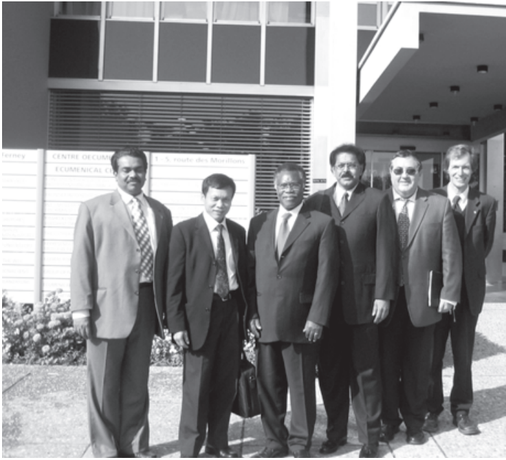
CCA delegates at Ecumenical Centre in Geneva, Switzerland