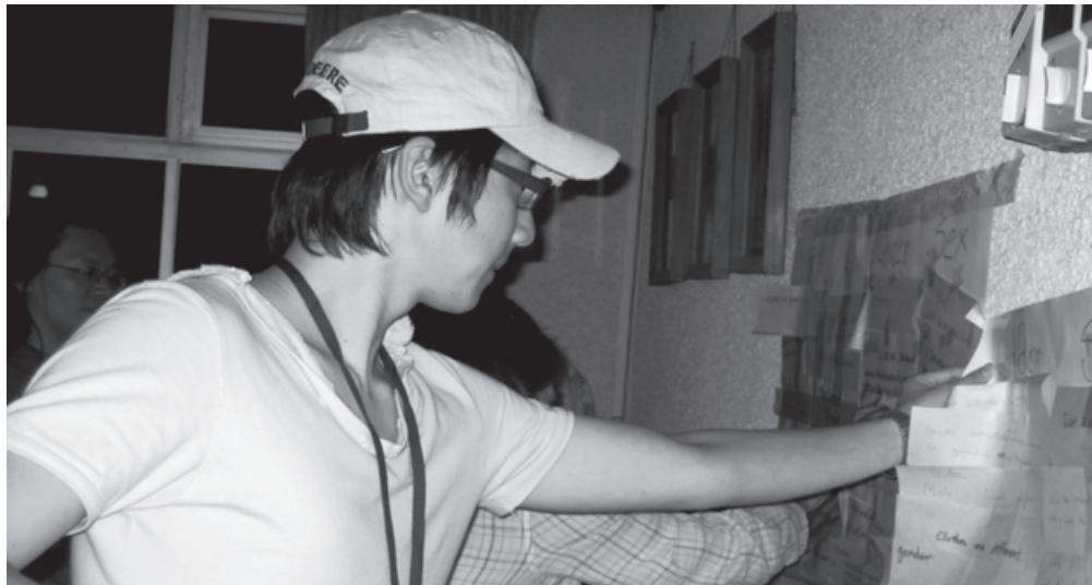
Korean participant at SELF

Young people should be at the forefront of global change and innovation