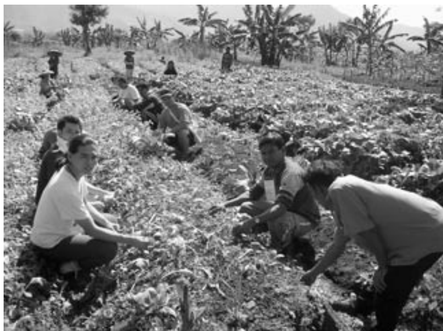
Participants of ASYG on an exposure trip

A detailed report of ASYG 2004 will be published soon.