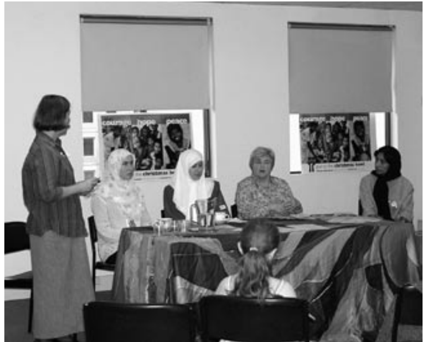
Christians interview Muslim women at an interfaith forum in Sydney