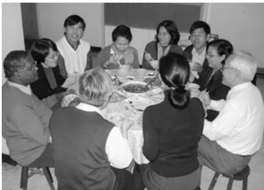
Participants sharing experiences, food and dreams around a mealtable

The CCA-FMU desk organised and facilitated this meeting, with support from ACHEI.