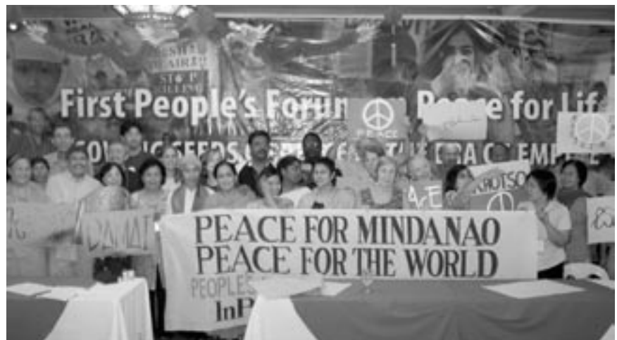
Participants from all parts of the globe at the people's forum

The story of the people of Mindanao is the same story for many other people of the non-industrial South, pushed to the peripheries where no opportunities exist, untouched by economic programs, and unbenefited by development aid.