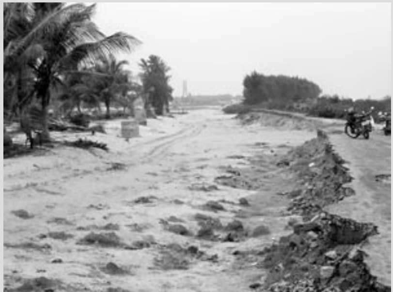
The tsunami has had a devastating effect on the lives of millions