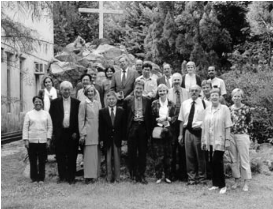
EED delegation with CCA staff