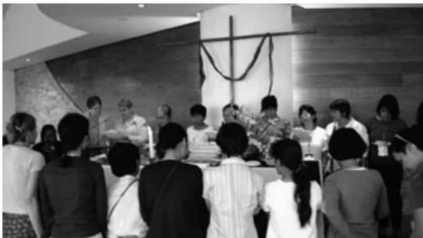
Closing worship and celebration