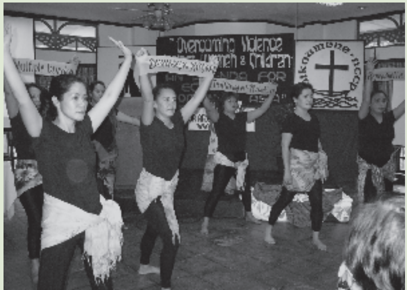
BATIS women exploring forms of violence against women