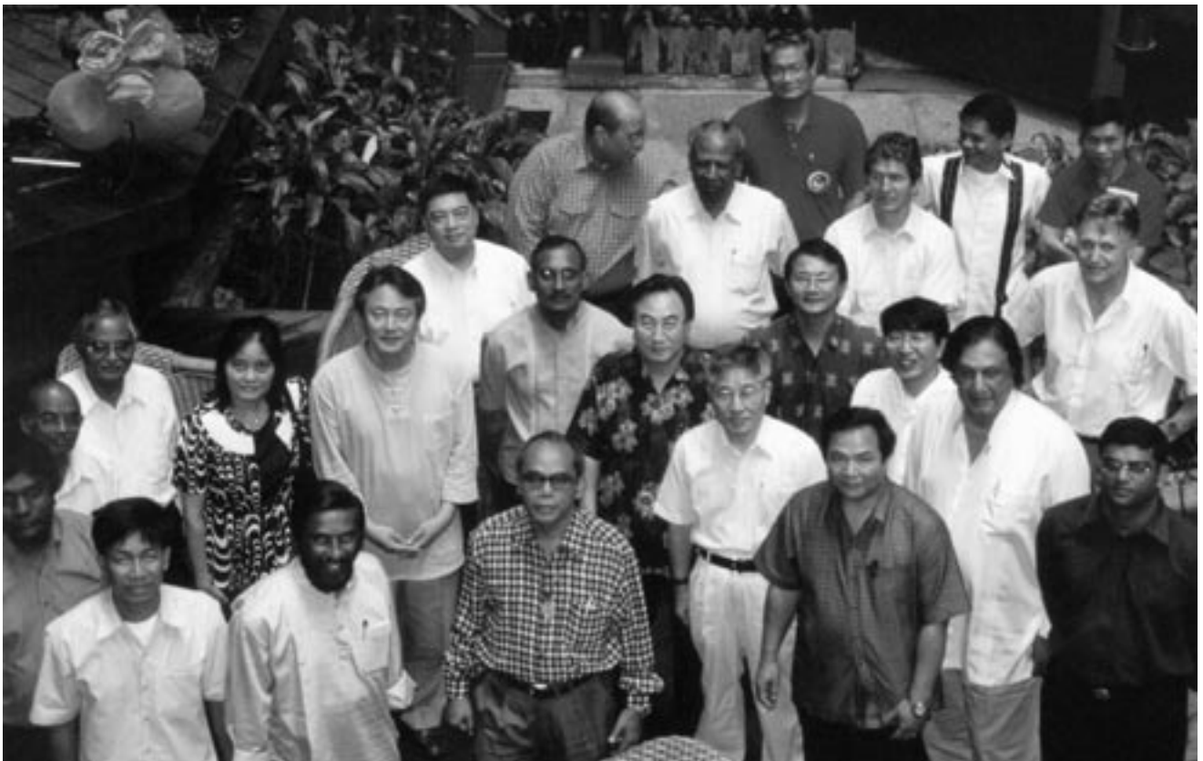
Participants at the NCC general secretaries' meeting

'We are now witnessing widening gaps between societies and within societies. Individuals and communities are marginalised, and success seems to be measured by the ability to squander resources in unsustain-