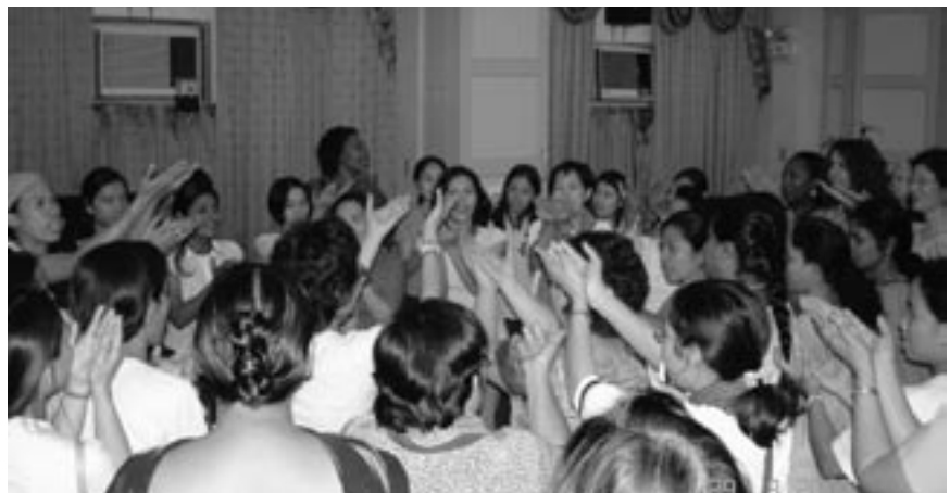
An evening with other women's groups

It follows a neo-liberal economic model that has made the market into an absolute, and is leading the world towards systemic crises, increased vulnerability, globalisation of inequality and continuous ecological destruction. It has also been accompanied by heightened repression, militarisation and massive human rights violations—for where