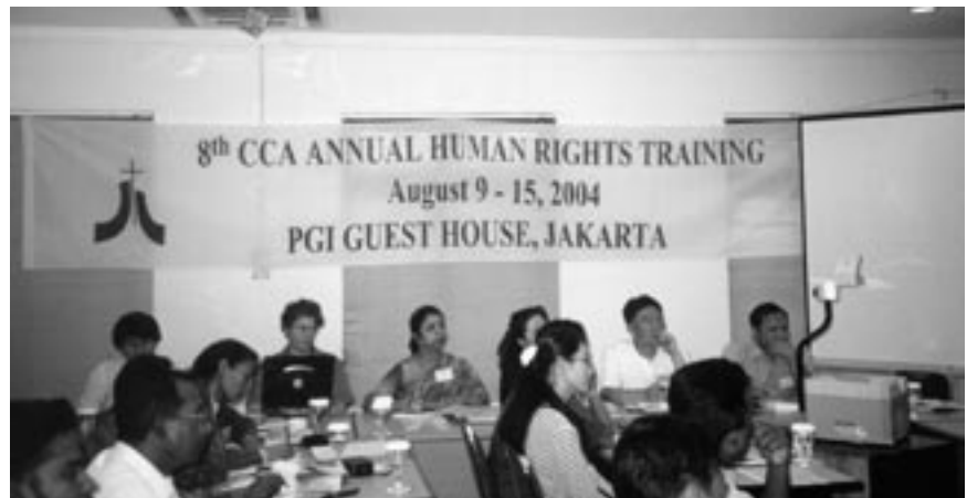
Human rights training in progress