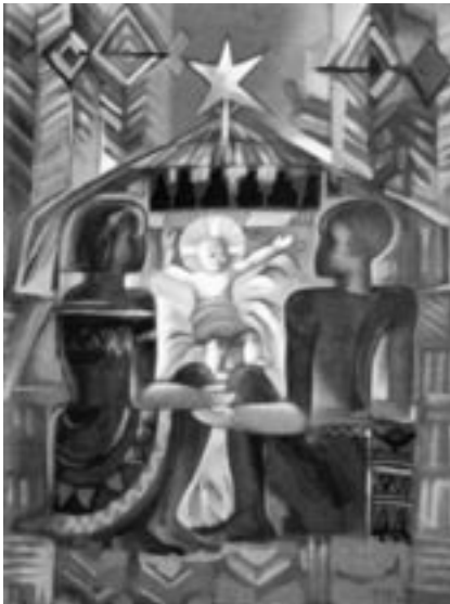
Cover: 'Nativity', by Le Van Dai, originally from Vietnam. (From 'The Bible through Asian Eyes', courtesy Asian Christian Art Association.)

The ecumenical movement has a prophetic role to play in our lives. It has always been in the forefront showing the signs of times when the majority of people live with a deep sense of hopelessness and helplessness. In this age of war on terrorism and negative effects of globalisation, it has become all the more important for the ecumenical movement to reclaim its prophetic heritage.