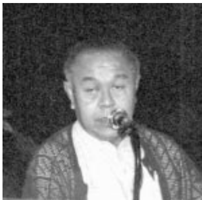
Prof. Sulak Sivaraksa delivers a paper at the conference

Churches should hold forums joined by resource persons from dif-