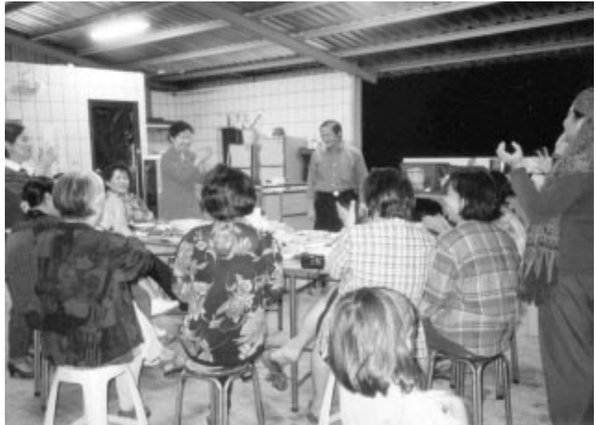
Participants visit an Atyal aboriginal community in Taiwan