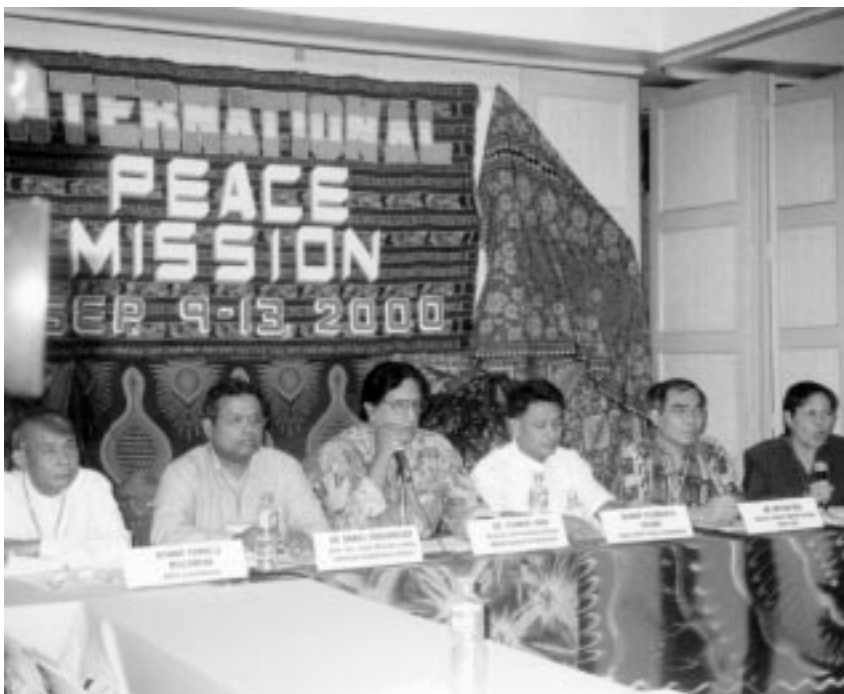
Some of the participants at the International Peace Mission in Mindanao

A subgroup of the International Peace Mission paid a call on Jaime Cardinal Sin, Archbishop of Manila, and exchanged concerns about the Mindanao situation and President Joseph Estrada's leadership. They expressed their sentiments about the government's approach to resolving the conflict in the south and encouraged the cardinal to continue his efforts at issuing pastoral statements to his flock and giving impetus to public demonstrations against the worsening political and economic situation. They were assured by him that the churches, both Roman Catholic and Protestant, were lending support to the people's movement that was taking the President to task. The group also spent a few hours at the Payatas dump site, the mountain of garbage which caved in on 10 July 2000. They saw the extent of the damage and what was being done to rehabilitate the area. They then talked with community organisers who are helping to rebuild people's lives. The international peace advocates also paid a courtesy call on Vice President Gloria Macapagal Arroyo, who listened to the concerns of the group and promised to relay them to the President and the National Security Council.